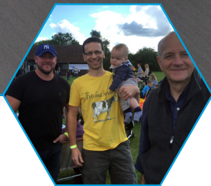
WJ CHIEF SPONSORS OF BERKOFEST