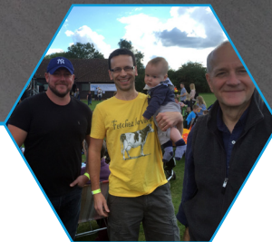
WJ CHIEF SPONSORS OF BERKOFEST